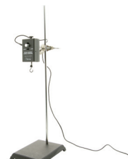
Mounted for vertical data collection

You should not have to perform a new calibration when using the Dual-Range Force Sensor in the classroom. The sensor is sensitive enough to measure the weight of the sensor hook. To minimize this effect, simply place the sensor in the orientation in which it will be used (horizontal or vertical) and choose zero in the software. Much like pressing “Tare” on a scale, zeroing will define the current situation as 0 N of force.